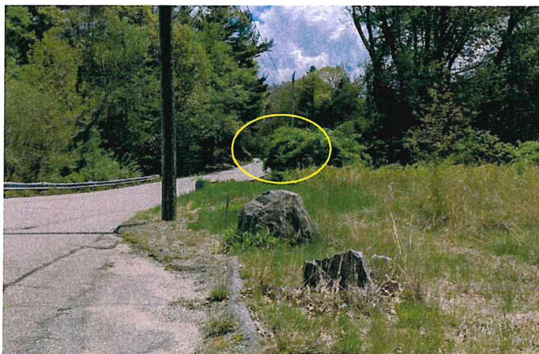
Vegetation to be cleared on Kendall Road

It should be noted that the 85 th percentile speeds measured on the roadway were 50 miles per hour, or 20 miles per hour over the posted speed limit. I recommend limiting traffic to right turns only exiting the driveway or installing warning sign W10-1d on westbound Kendall Road approximately 125 feet in advance of the horizontal curve in the road to alert drivers to the presence of the campground driveway at the end of the curve.