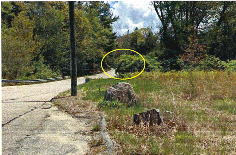
Vegetation to be cleared on Kendall Road

It should be noted that the 85 th percentile speeds measured on the roadway were 50 miles per hour, or 20 miles per hour over the posted speed limit. I recommend limiting traffic to right turns only exiting the driveway or installing warning sign W10-1d on westbound Kendall Road approximately 125 feet in advance of the horizontal curve in the road to alert drivers to the presence of the campground driveway at the end of the curve.