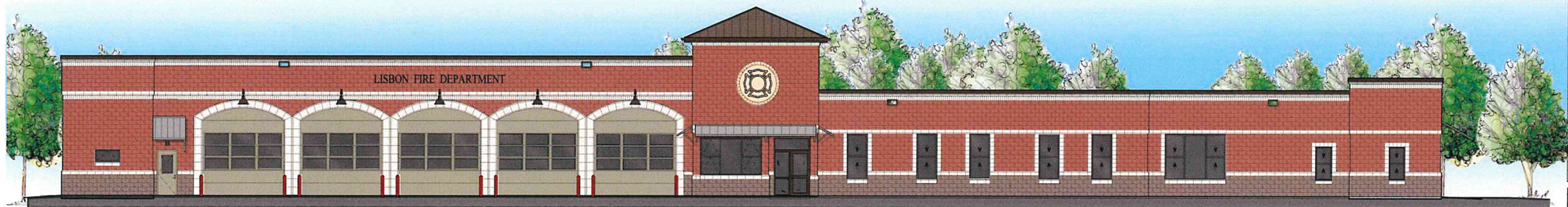
1 NORTH ELEVATION A200 SCALE: 1/8" = 1'-0"