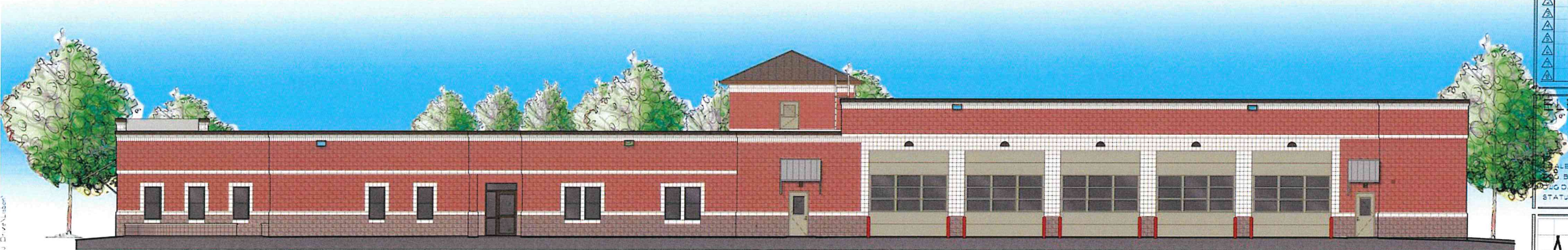
4 SOUTH ELEVATION A200 SCALE: 1/8" = 1'-0"

MA MITCHELL ASSOCIATES ARCHITECTS PLLC 24 THACHER PARK ROAD VOORHEESVILLE, NY 12184 (518) 745-4571 FAX (518) 745-2850 WWW.MITCHELL-ARCHITECTS.COM