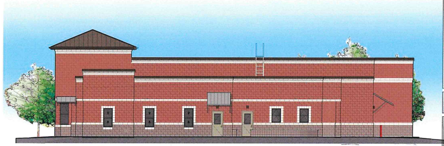
2 WEST ELEVATION A200 SCALE: 1/8" = 1'-0"