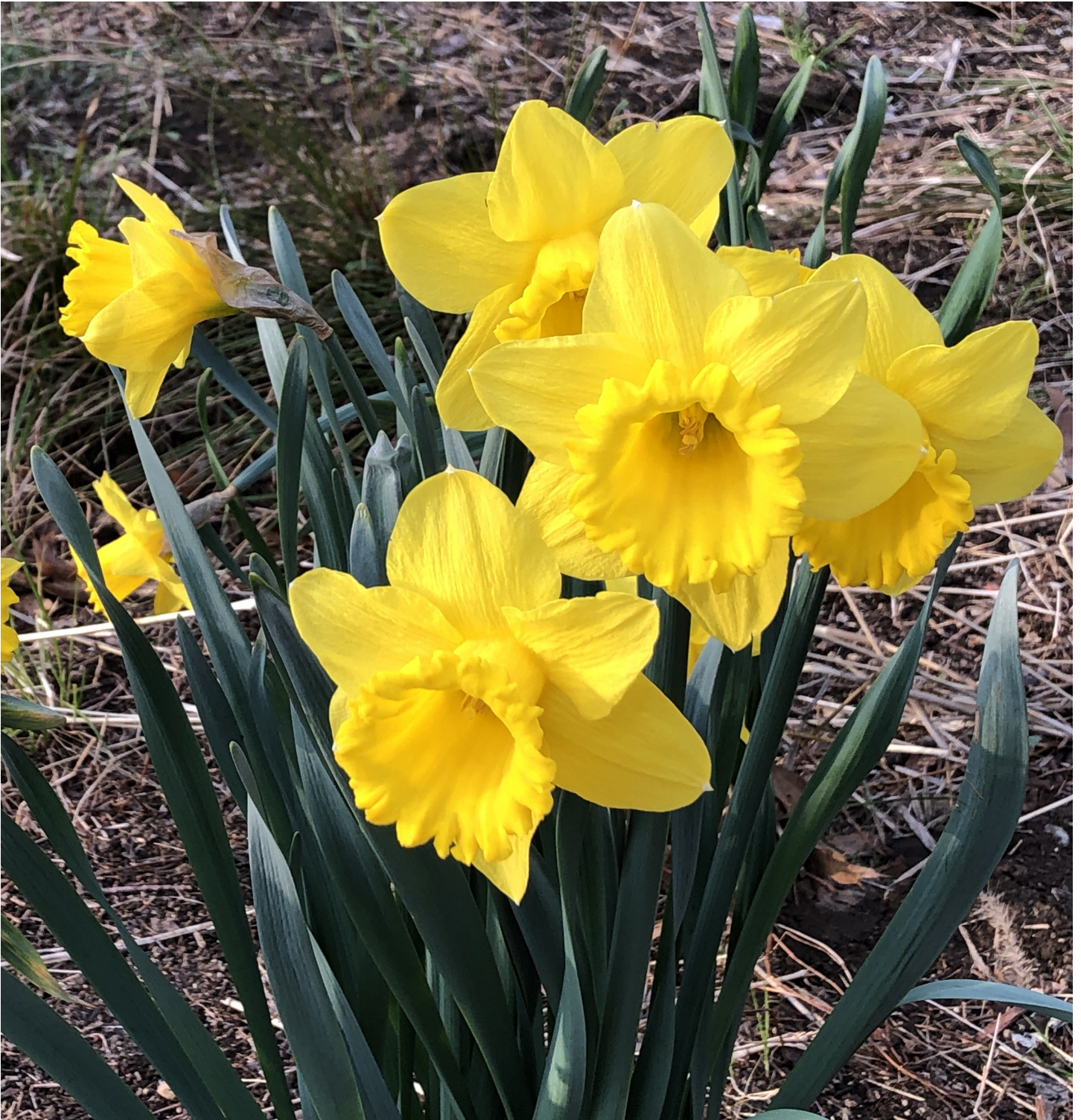
Each Spring, the daffodils grow abundantly at Lisbon Meadows Park.