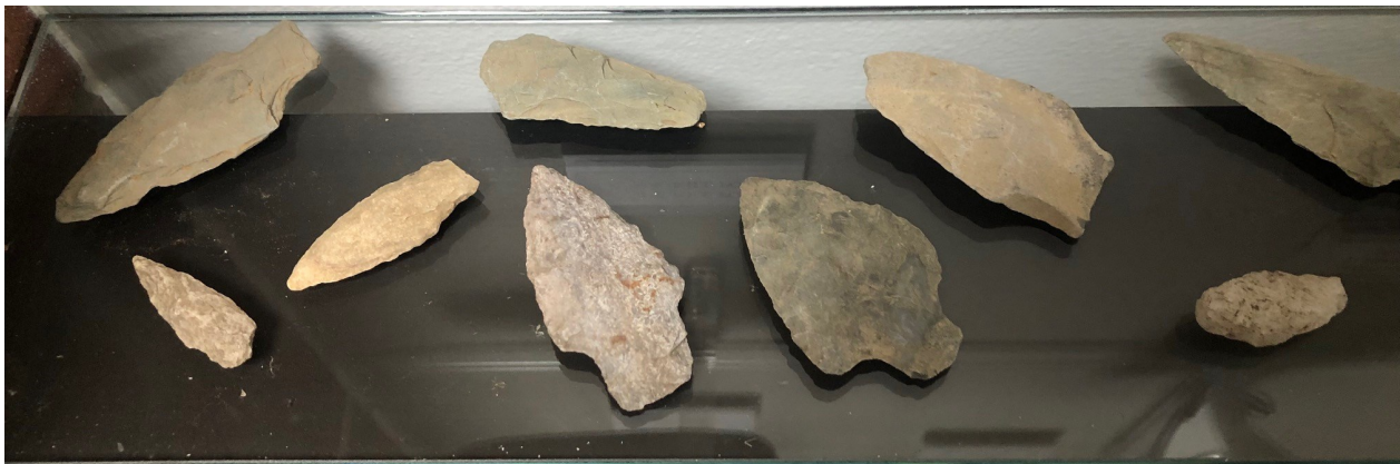
The Lisbon Town Hall has a collection of locally found Native American arrowheads and other tools on display.

Materials are naturally preserved in sediment from floods, volcanic eruptions, glaciers, snow, mud and rock slides and building rubble. Once an items have been documented at the dig site, they are sent to a lab where they are washed, catalogued, analyzed, and interpreted by measuring, weighing, drawing, and comparing to other similar items found at the site. They are then sent to appropriate museums, such as the American Museum of Natural History, for posterity.