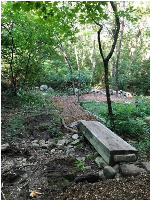
Foot bridge at Burnham Tavern Trails, installed by the Trail Committee.

The Trail Committee will be hosting a socially distanced, guided walk along the Burnham Tavern Trails on Saturday, October 3rd at noon in conjunction with The Last Green Valley National Heritage Corridor's Walktober 2020 events. During the Tavern Trail Ramble, Trail Committee members will share the efforts undertaken to complete and maintain the trails along with providing information about the historical and contemporary use of the property. Parking is available at 62 Kimball Rd and participants are required to wear masks to ensure the safety of all participants. In the event of inclement weather the walk will be postponed to Sunday, October 25th at noon. Walktober 2020 events around the region begin the week of September 14th and continue through the end of October. See TLGV's website at https://thelastgreenvally.org/walktober/ for a detailed listing of events.